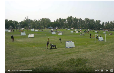
U10 - U11 Initiatives to Prevent Lopsided Matches