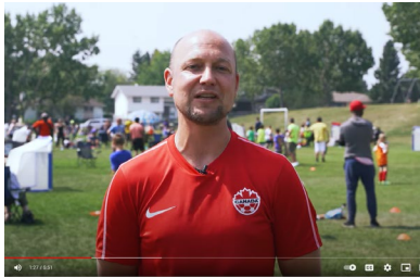
All About the CMSA Grassroots League (U7-U9)

Click on any of the videos below to watch. These videos and more can be found on CMSA's Youtube Channel.