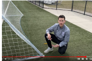
How to Set Up a Farpost Soccer Net