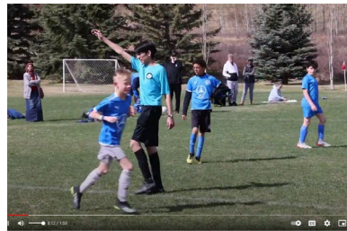
CMSA's Teal Shirt Campaign (First Year Referees)