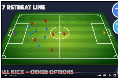
Soccer Retreat Line Explained (coming soon)